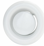
Exhaust air vent Ø100 steel