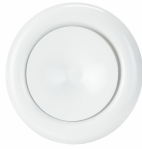
Air supply vent Ø100 steel