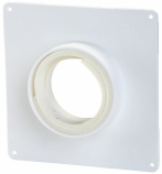
Exhaust air kit Eos