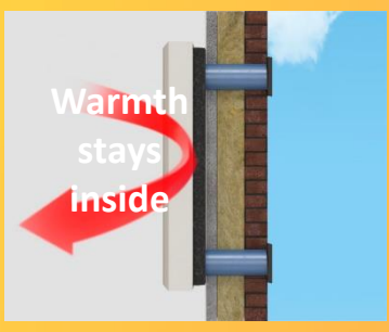
Fresh-r is like a breathing window